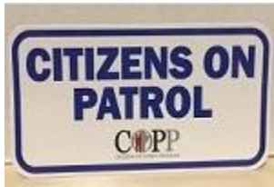
Back Window and Door Vehicle Sign

To review the COPP Equipment Policy click here .